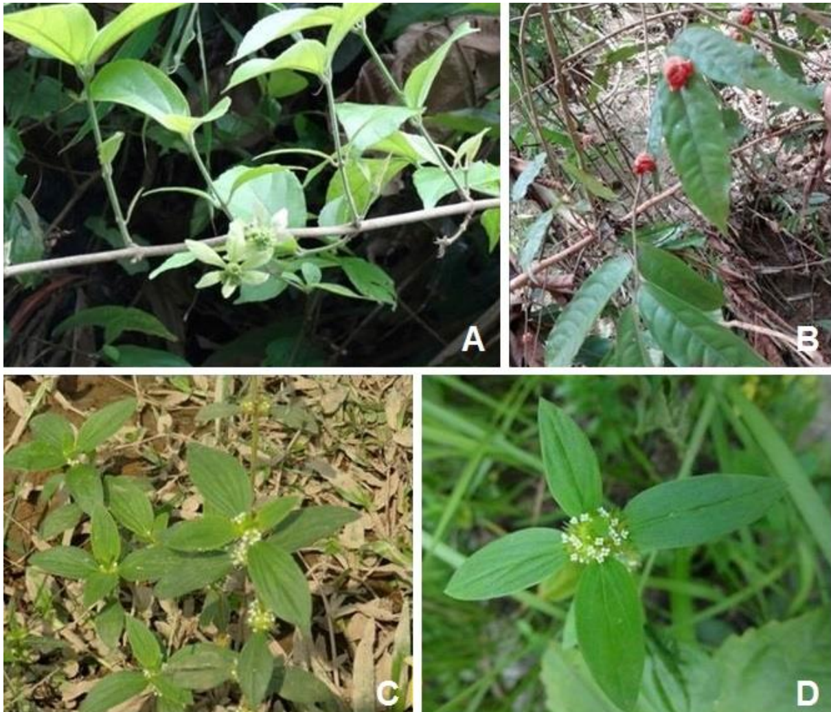
Figure 2. A, Symphorema involucratum ; B, Miliusa balansae ; C & D, Spermacoce ocymoides .

Occurrence in Bangladesh : This species was collected from two regions; one is Chittagong University Kata Pahar road side (22°28'15.4"N 91°47'23.5"E), Hathazari, Chittagong, Bangladesh and another collection place is Toitong High School road side (21°53'00.2"N 91°58'22.5"E), Pekua, Cox's Bazar, Bangladesh.