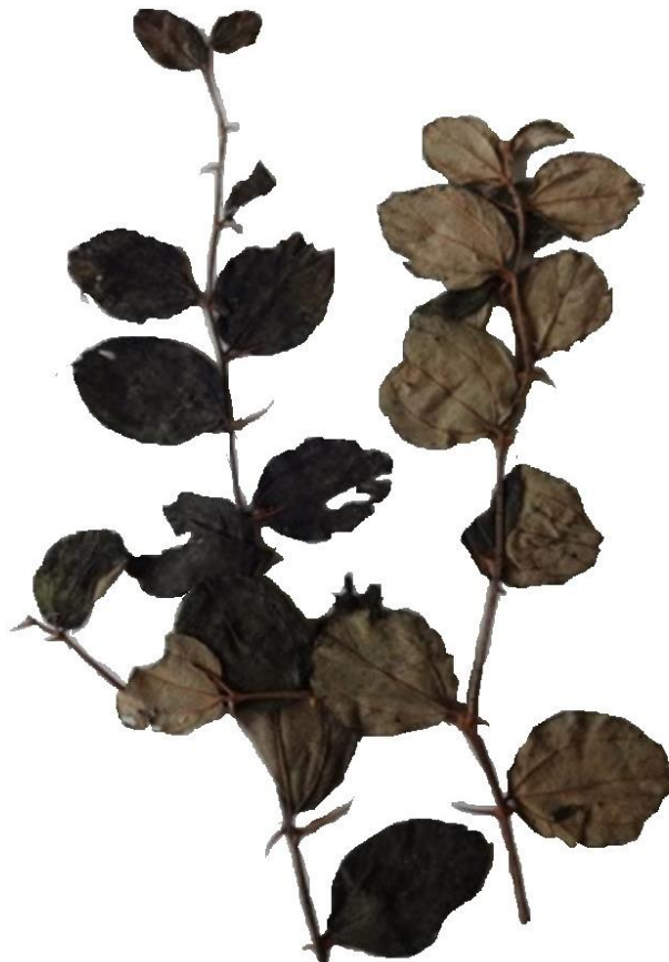
Figure 2. Black mildew infection on leaves of Ziziphus nummularia .

Material examined: India, Himachal Pradesh, Berthin (Distt. Bilaspur), 673 meters (2,208 ft), on leaves of Ziziphus nummularia (Rhamnaceae), October - December 2015, coll. Ajay K. Gautam.