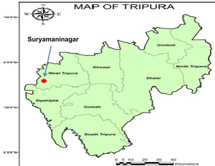
Figure 1. Map showing the study area (Suryamaninagar) of the West Tripura district, Tripura.

of respective species were performed to estimate the total soluble sugar with Anthrone Reagent by the method of Yemm & Willis (1954). In this, 500 mg freshly harvested leaves of plants were homogenized in 10 ml of 50% aqueous ethanol with a pinch of activated charcoal. The slurry was centrifuged at 5000 rpm for 10 min and free amino acids were extracted in the form of a clear supernatant. The volume of supernatant was raised to 10 ml with aqueous 50% ethanol. To 1 ml of the supernatant 2 ml of 2% freshly prepared anthrone reagent was added. The absorbance of the green coloured complex was taken at 620nm. Glucose was used as standard.