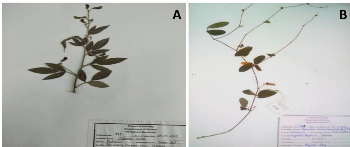
Figure 2. A, Herbarium specimen of Cajanus cajan ; B, Herbarium specimen of Cajanus scarabaeoides .

The amount of total free amino acid was estimated following the method of Yemm & Cocking (1955). Freshly harvested leaves (500 mg) of plants were homogenized in 10 ml of 50% aqueous ethanol with a pinch of activated charcoal. The slurry was centrifuged at 5000 rpm for 10 min and free amino acids were extracted in the form of a clear supernatant. The volume of supernatant was raised to 10 ml with aqueous 50% ethanol. To 1 ml of the supernatant 2 ml of 2% Ninhydrin (w/v in dehydrated alcohol) was added. The mixture was kept on water bath at 75 \pm 2 °C for 10 minutes and after cooling, aqueous alcohol (1:1) was added to make up the volume to 3 ml. The absorbance of the violet complex was measured at 570 nm on a spectrophotometer. The amount of total free amino-acids was calculated with the help of a standard curve prepared from glycine and was expressed as mg of amino acids per gram fresh weight of the sample.