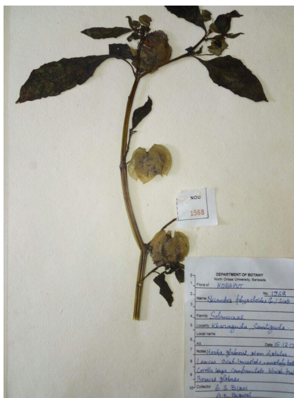
Figure 2. Herbarium specimen of Nicandra physalodes (L.) Gaertn.