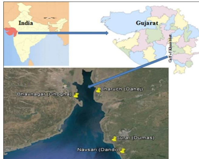
Figure 1. Aerial view of four selected sites