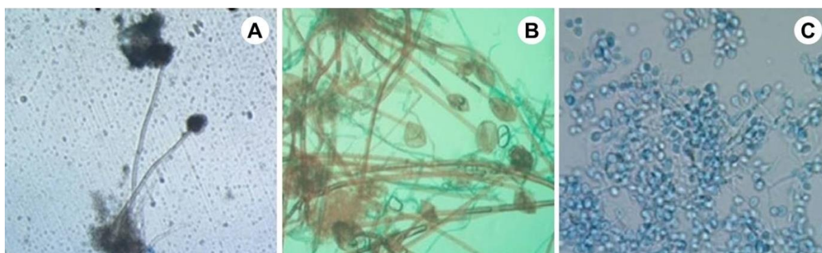
Figure 3. Fungal species identified in the non-rhizospheric soil sample: A, Aspergillus niger van Tieghem; B, Rhizopus stolonifer Vuillemin; C, Unidentified fungi-1.