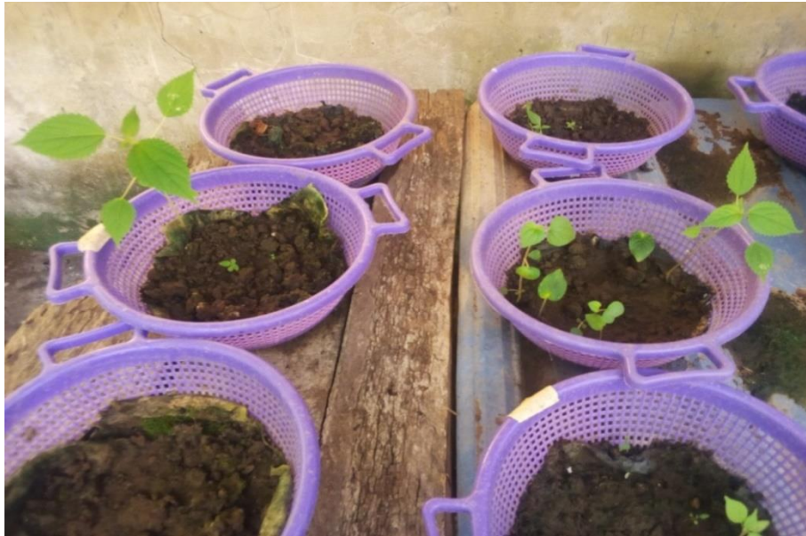
Figure 2. Showing the soil seed emergence.

self- made calibration. The samples were put in polythene bags, labeled. Soil composite were made out of the soil samples collected from the location after thoroughly merged them. The soil seed bank from each location and depth were removed of roots and pebbles and stored in a potting medium of the perforated plastic tray, covered with a cotton cloth to keep the sample moist always (Fig. 2). The sample was taken to the greenhouse at the Department of Forestry and Wood Department's nursery, FUTA where they were incubated to stimulate seed germination. Emerging and readily identifiable seedling was counted, recorded and discarded. Every two weeks, the soil samples were stirred to stimulate seed germination and to encourage seed sprouting during the period of the project. The germinated seedlings were countered and identified. For data analyses, appropriate formulae were involved in basal area computation. Biodiversity indices were adopted to determine species abundance and evenness and to compare community diversity. Descriptive statistics were used to determine the density of trees, shrubs, saplings, seedlings and abundance of soil seed bank distribution.