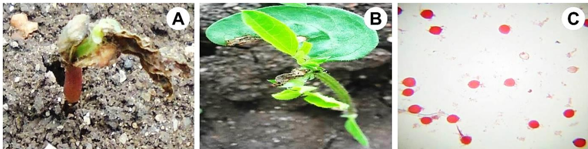
Figure 2. A & B, Injured seedlings; C, Sterile and fertile pollen grains.