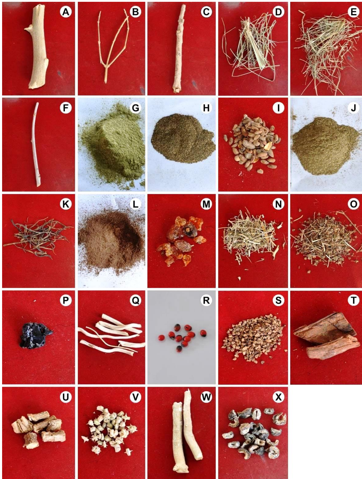
Figure 2. A, Dry stem of Acacia catechu (L.f.) Willd.; B, Dry stem of Achyranthus aspera L.; C, Dry Stem of Ficus religiosa L.; D, Dry Whole plant of Desmostachya bipinnata (L.) Stapf; E, Dry Whole plant of Cynodon dactylon (L.) Pers; F, Dry Stem of Calotropis procera (Ait) Ait.; G, Dry powder of Euphorbia hirta L.; H, Dry Powder of Barleria prionitis L.; I, Dry Fruit of Azadirachta indica A. Juss.; J, Dry Pod powder of Acacia nilotica (L.) Delile; K, Dry fruit of Prosopis cineraria (L.) Druce L. Dry Bark powder of Acacia nilotica (L.) Delile; M, Dry Gum of Acacia senegal Willd.; N, Dry whole plant Fagonia indica L.; O, Dry whole plant of Ocimum sanctum L.; P, Dry Aloe vera (L.) Burm. f.; Q, Dry Tuber of Asparagus racemosus Willd.; R, Dry Fruits of Abrus precatorius L.; S, Dry Seed of Datura stramonium L.; T, Dry Bark of Tecomella undulate (Sm.) Seem; U, Dry Stem of Tinospora cordifolia (Willd.) Miers; V, Dry Fruit of Pedaliium murex L.; W, Dry Root of Withania somnifera Dunal; X, Dried fruits of Emblca officinales Gaert.

specimen were deposited in the Herbarium of Department of Botany, University of Rajasthan, Jaipur.