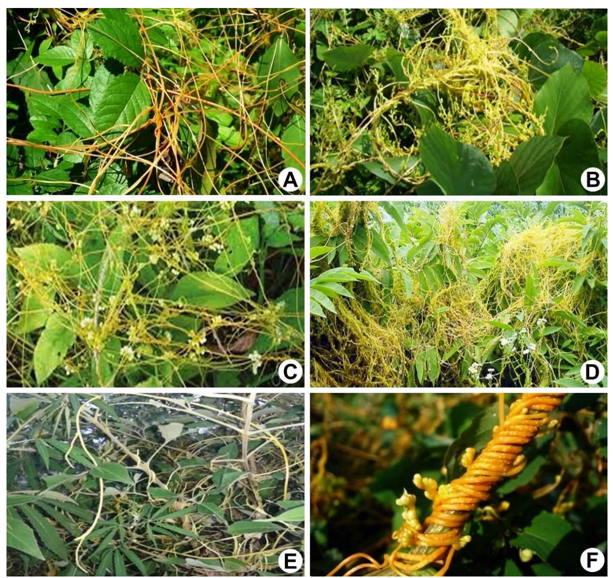
Figure 1. Plant affected by Cuscuta reflexa Roxb. in Betla National Park, Jharkhand: A–B, Ziziphus mauritiana Lam.; C–D, Cajanus cajan Lam. E–F, Ficus glomerata Roxb.

20 Moringa oleifera Lam. Moringaceae Vegetable Sahjan, 21 Caesalpiniaceae Medicine Tamarindus indica L. Imali 22 Terminalia bellirica (Gaertn.) Roxb. Bahera Combretaceae Medicinal 23 Terminalia chebula Retz. Harra Combretaceae Medicinal 24 Madhuca longifolia L. Mahua Sapotaceae Medicinal drug 25 Vitex negundo L. Nirgundi Verbenaceae Medicinal 26 Cajanus cajan (L.) Millsp. Arhar Fabaceae Pulses 27 Ziziphus mauritiana Lam. Ber / plum Rhamnaceae Fruit 28 Shorea robusta Gaertn. Sal / Sakhua Dipterocarpaceae Wood 29 Annona squamosa L. Sitaphal Annonaceae Fruit 30 Pyrus communis Decne. Naspati Rosaceae Fruit Shisam Fabaceae Wood 31 Dalbergia sissoo Roxb. Kaner 32 Nerium oleander L. Apocynaceae Ornamental Gular 33 Ficus glomerata Roxb. Moraceae Medicinal