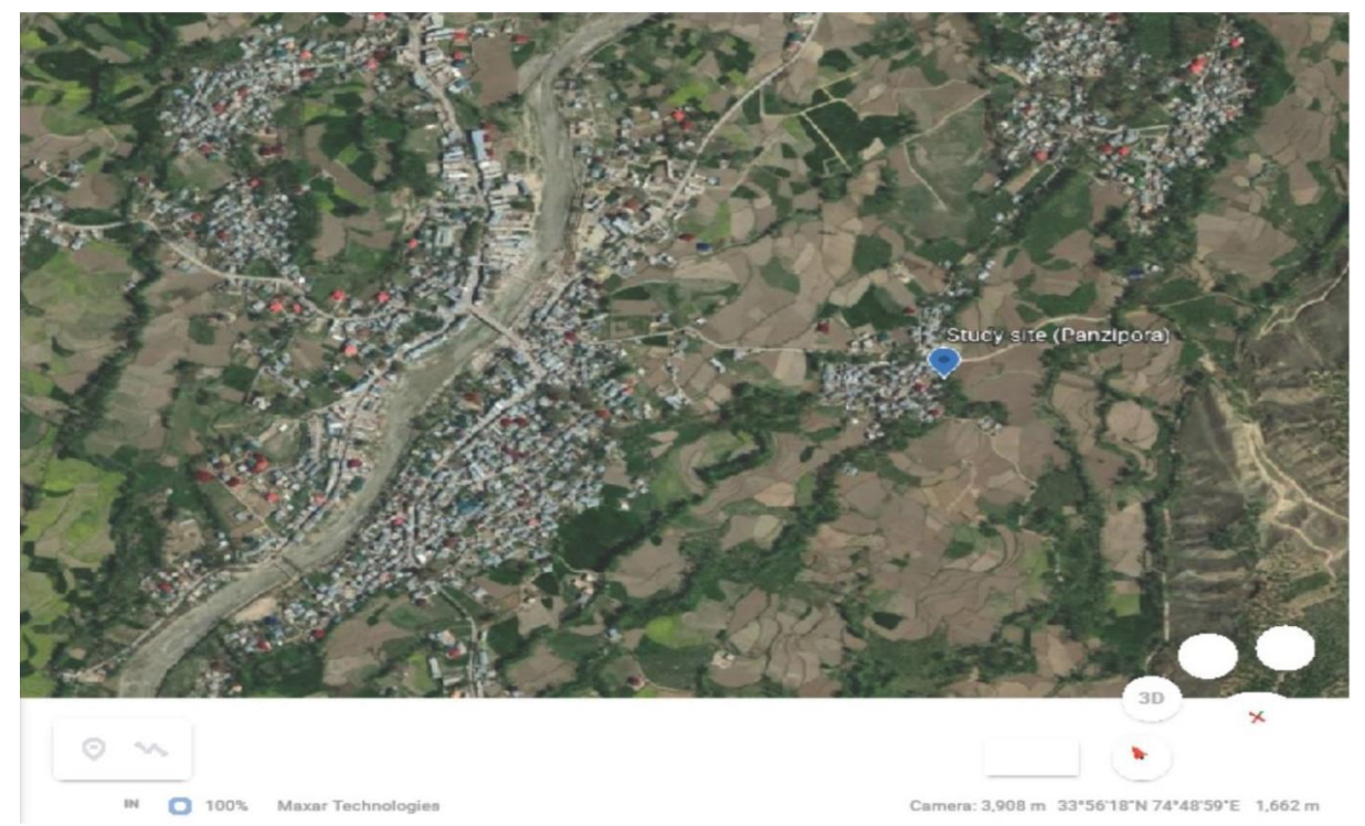
Figure 1. Satellite imagery showing study site - Panzipora.

The present investigation has been carried out around the Panzipora which is a quite remote village and hidden from the common eye. The hamlet lies on enroute to Arizal. This area is mostly agricultural having a good frequency of orchards (Fig. 1). The survey site had Malus domestica Borkh. and Juglens sps. plantation and seemed free from any direct polluting source. Thus the stimulus behind the survey in this particular area was our attempt to contribute to lichen inventory, especially from rural areas. Also, the ecology and diversity of lichens would provide us with an idea about the status of the local environment in the area.